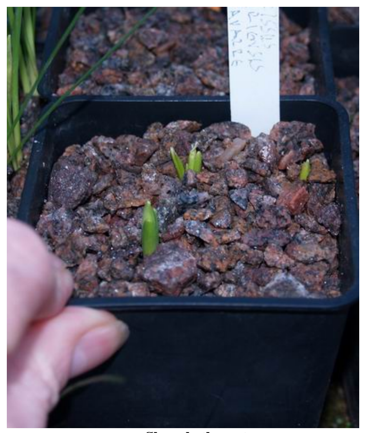
Shoogle the pot

I really enjoy watering the pots, especially at this time, because you see the new growth as it first appears poking its way through the gravel and often what looks like just one shoot can be greatly improved by giving the pot a gentle shoogle (a Scottish word for 'shake') to settle the gravel to reveal more promising growth.