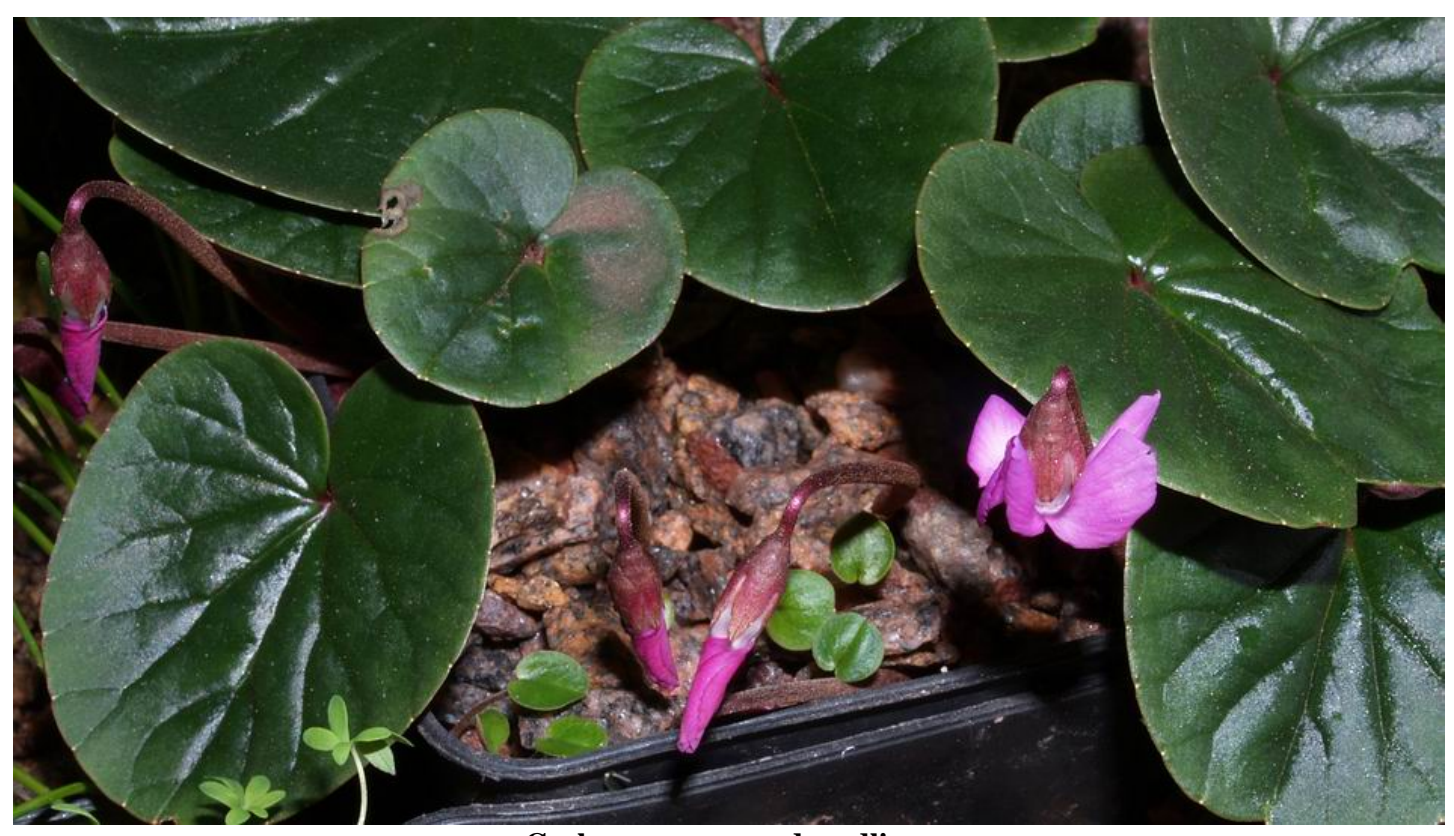
Cyclamen coum and seedlings

quite thickly then I just work the seeds into the surface with a small implement (pot on left) before covering them over with gravel and placing them in an outside frame.