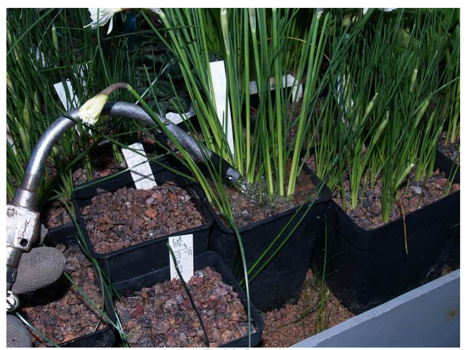
Flood the Pots

The spores of many of the fungal problems that infect the leaves of bulbs are water borne so avoiding the splashing of water around the leaves minimises the spread of any such pathogen.