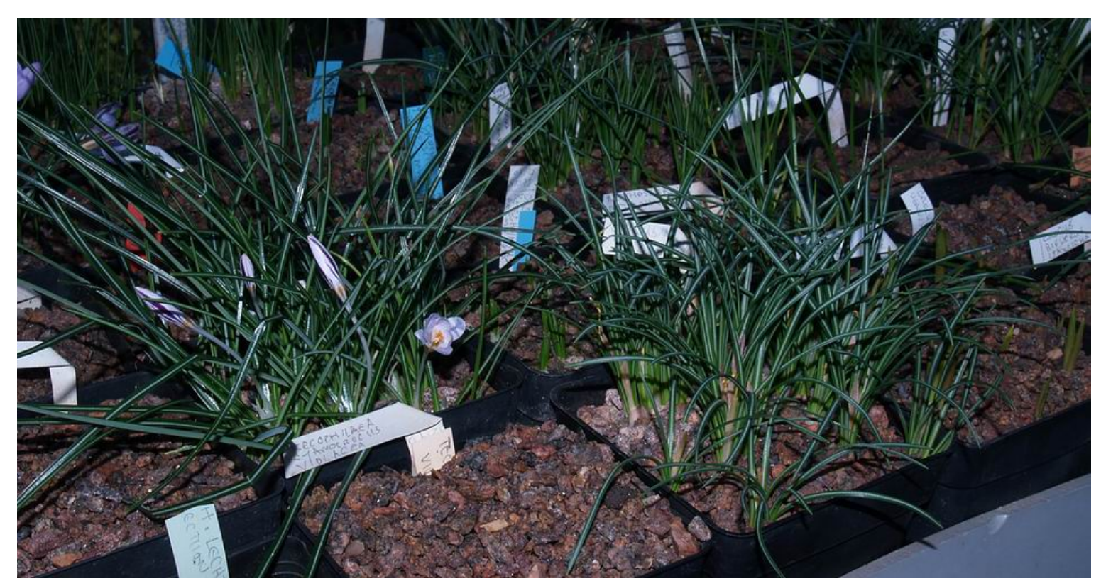
Crocus with dead flowers removed

I use the same watering rule for Crocus, that is water in proportion to the amount of leaves showing but it is important to first remove any dead flowers from the plants. If you do not remove these faded flowers before watering you greatly increase the risk of getting a grey mould (Botrytis) infection.