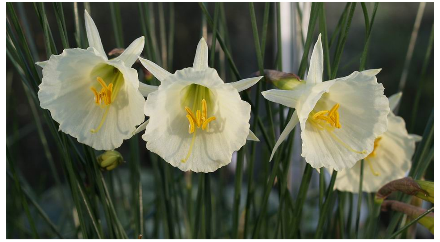
Narcissus romieuxii albidus zaianicus natural light