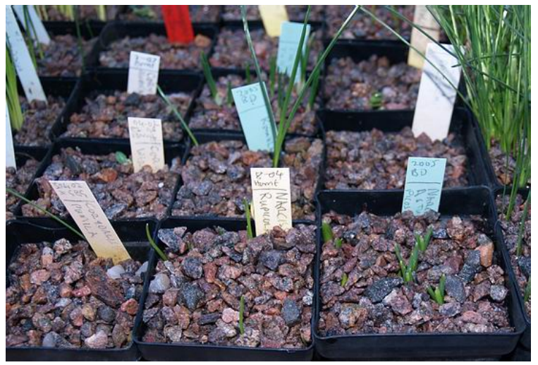
Growth just appearing

The basic rule of thumb I apply is to water in proportion to the amount of leaves showing so if growth is just appearing as in these pots above they require a smaller amount of water. The danger for these bulbs is that they are not yet in rapid growth so they cannot take up too much water and there is a danger of wet root if the compost stays soaked.