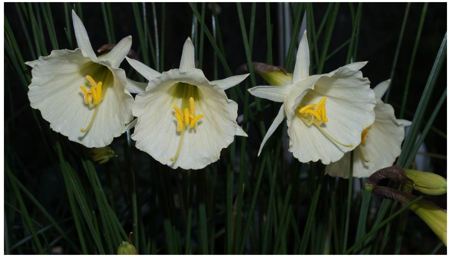
Narcissus romieuxii albidus zaianicus flash

Thanks to everyone who made contact regarding the Bulb Log now being in the PDF format: the response has been very positive. Thanks, also to those who had a go at identifying, from last week's Log, the mystery plant in a dormant state, most were close and some correctly identified Corydalis cashmeriana.