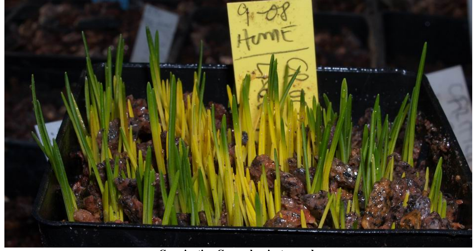
Germinating Crocus laevigatus seeds

In the Frit-house I found this pot of Fritillaria raddeana seedling leaves appearing for their second year of growth. They first germinated last year around this time as quite narrow leaves and now they are a wee bit wider and will grow that bit bigger as will the young bulbs underground – I will not repot these until summer of 2010.