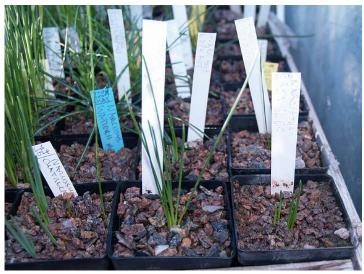
Small amount of leaves showing

The basic rule of thumb I apply is to water in proportion to the amount of leaves showing so if growth is just appearing as in these pots above they require a smaller amount of water. The danger for these bulbs is that they are not yet in rapid growth so they cannot take up too much water and there is a danger of wet root if the compost stays soaked.