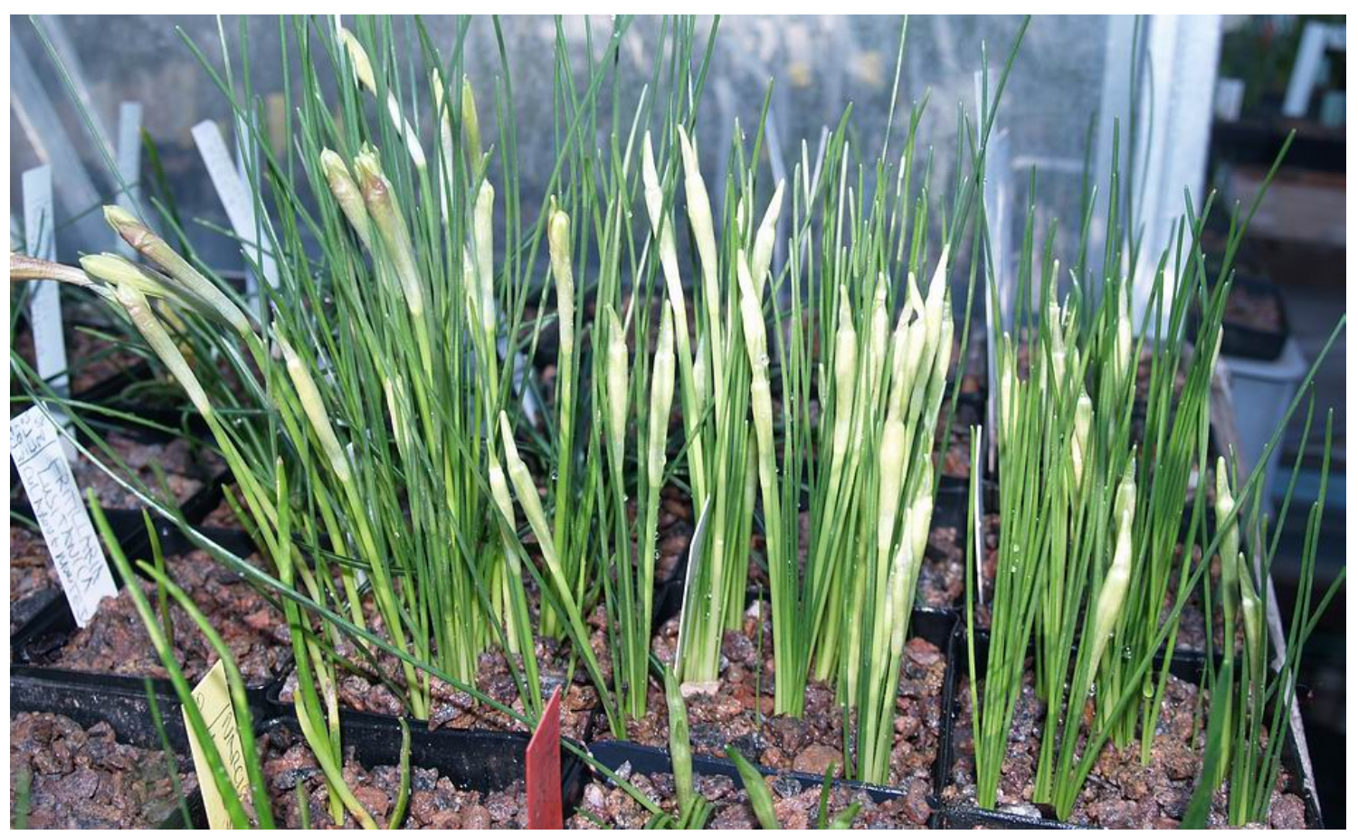
Pots full of Narcissus

It is very important to ensure that these winter flowering bulbs, especially the Narcissus and Crocus, get plenty water during this, their time of maximum growth. You can see how much growth and flower buds I have coming in each of these 7cm pots and they are all reliant on me to provide the water they need. I am taking advantage of this mild spell to give them a good soak.