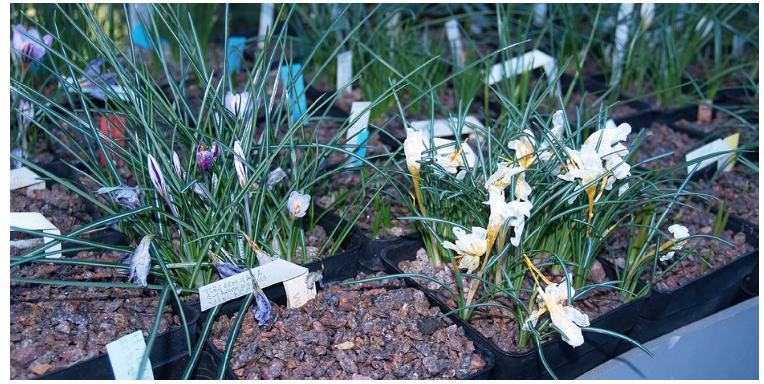
Crocus with spent flowers