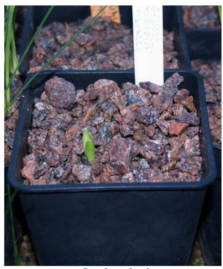
One shoot showing

When there is only a small amount of leaves showing or you only have one or two bulbs in a pot you still have to give these pots a good flooding but you then allow a longer period between floods to allow the compost to dry out a bit.