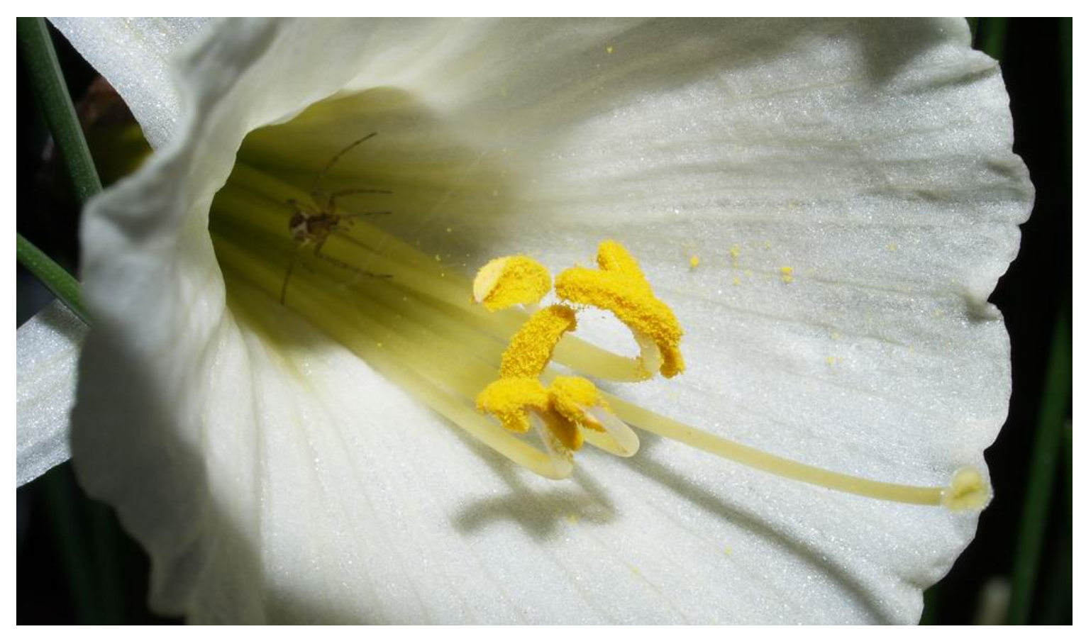
Surprise for pollinator

I will finish off this week with what I noticed when I was taking some close up pictures of the Narcissus flowers - this spider will be a real surprise for any pollinator that may be attracted to this flower. What an ingenious place to build a web you have a nice attractive and sheltered place to live, fairly safe from the Coal Tits (Periparus ater ) that regularly search the bulb house for tasty spider snacks, and the flower entices your pray into the trap.